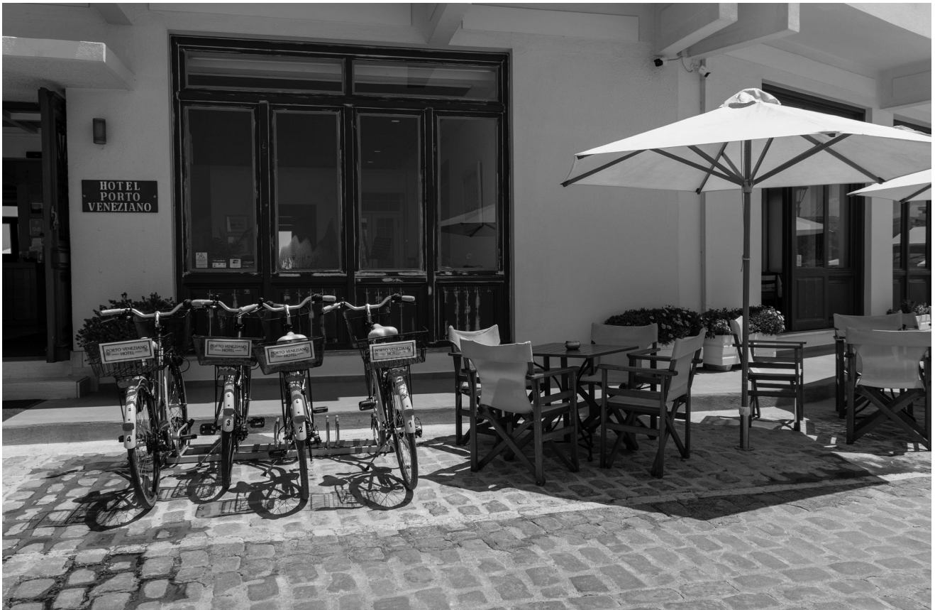
Fig. 2.1 for Question 2